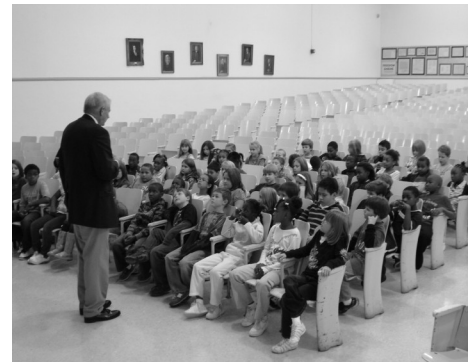
MAYOR WEATHERINGTON RECENTLY SPOKE TO THE THIRD GRADE CLASSES ABOUT DUTIES OF A MAYOR.